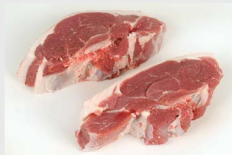
5. Bone-in Lamb Rump is cut/sawn into two portions.